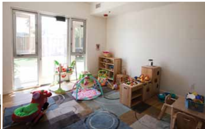
The infants-only room has plenty of floor space for babies to learn to roll over, crawl, and walk safely.

Thanks to our friends at All Saints-by-the-Sea Episcopal Church for contributing to the furnishings in our infants-only room. ⬆