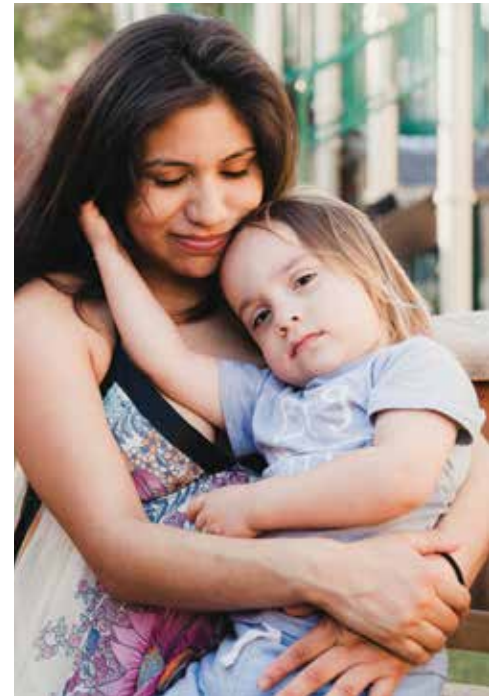
Families receive everything they need to rebuild their lives.

The most important thing we can do for children who are experiencing homelessness is to help their parents secure stable housing. We also foster resilience among these children by providing parenting classes to help parents better navigate the distress of homelessness with their children. We surround kids with caring adults (including many volunteers) who provide mentorship, warmth, and stability while they are with us. Every evening, school-aged kids receive a little TLC—Technology and Literacy for Children—that focuses on building reading and computer skills. Teens have their own group with facilitated discussions, artwork, dance, and academic support. Babies are enrolled in our sliding scale licensed Infant Care Center, which supports them in healthy development while allowing their parents to find full-time work. Volunteers help out in the Center to make it as warm and welcoming for the babies as possible.