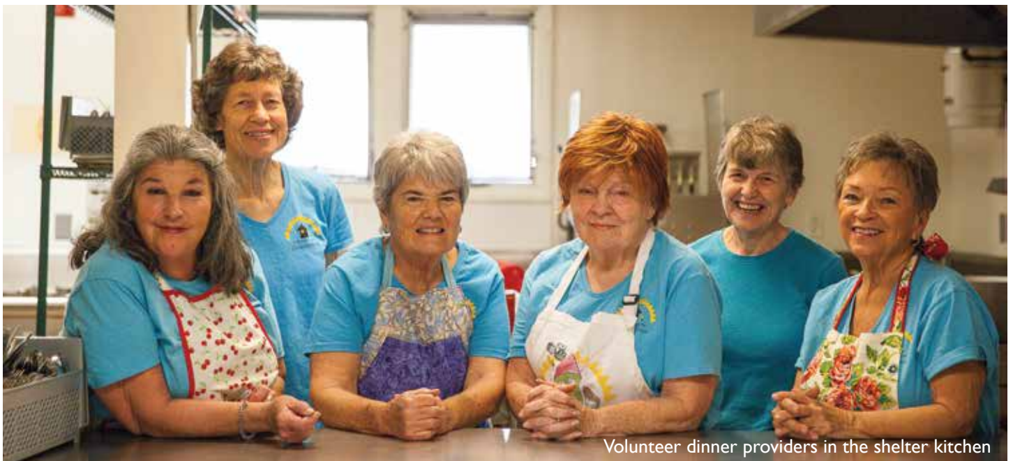
Volunteer dinner providers in the shelter kitchen

Volunteering is something that I believe in—helping, loving, and caring for others. Shelter residents are people who are trying to help themselves, and if I can help them in any way, then I want to do that. And I think all of us feel this way. It’s not work. We love it!