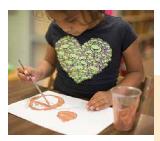
In 2016, 44 families moved to permanent housing with the help of Rapid Rehousing assistance.