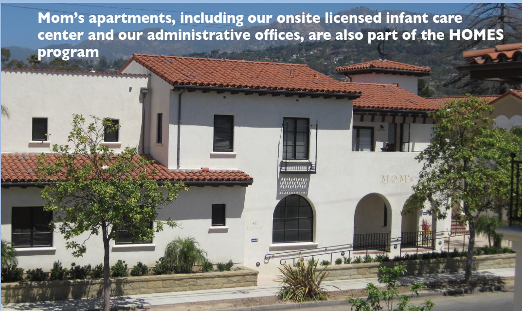
Mom's apartments, including our onsite licensed infant care center and our administrative offices, are also part of the HOMES program

We acquired and developed Casa Marianna and Mom's apartments in 1998 and 2012 respectively, bringing the units in our third stage supportive housing program called HOMES to 33, with two more units available for property managers. Families that are accepted into the apartments continue with case management. Most families move on after several years, opening up units for shelter families who follow them.