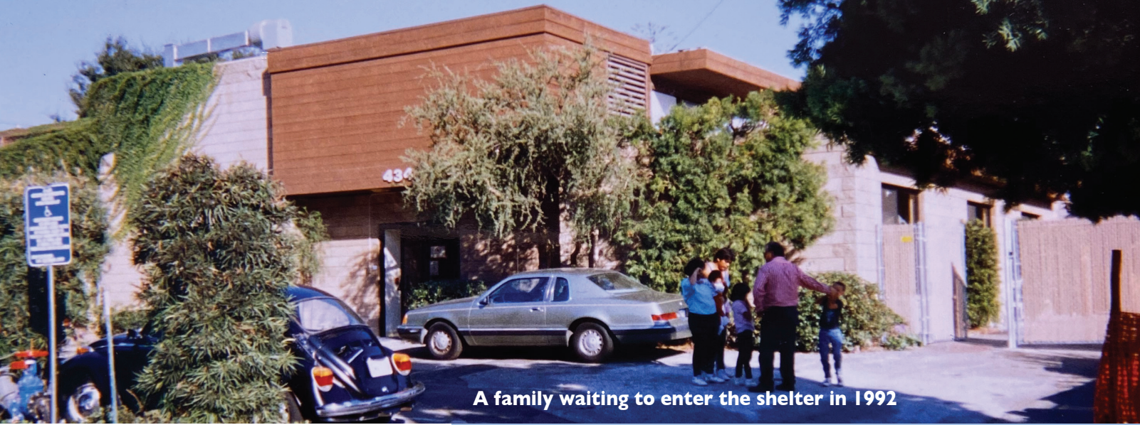
A family waiting to enter the shelter in 1992

A lthough Transition House was founded in 1984, we did not own our shelter space until 30 years ago when we purchased 434 E. Ortega Street.