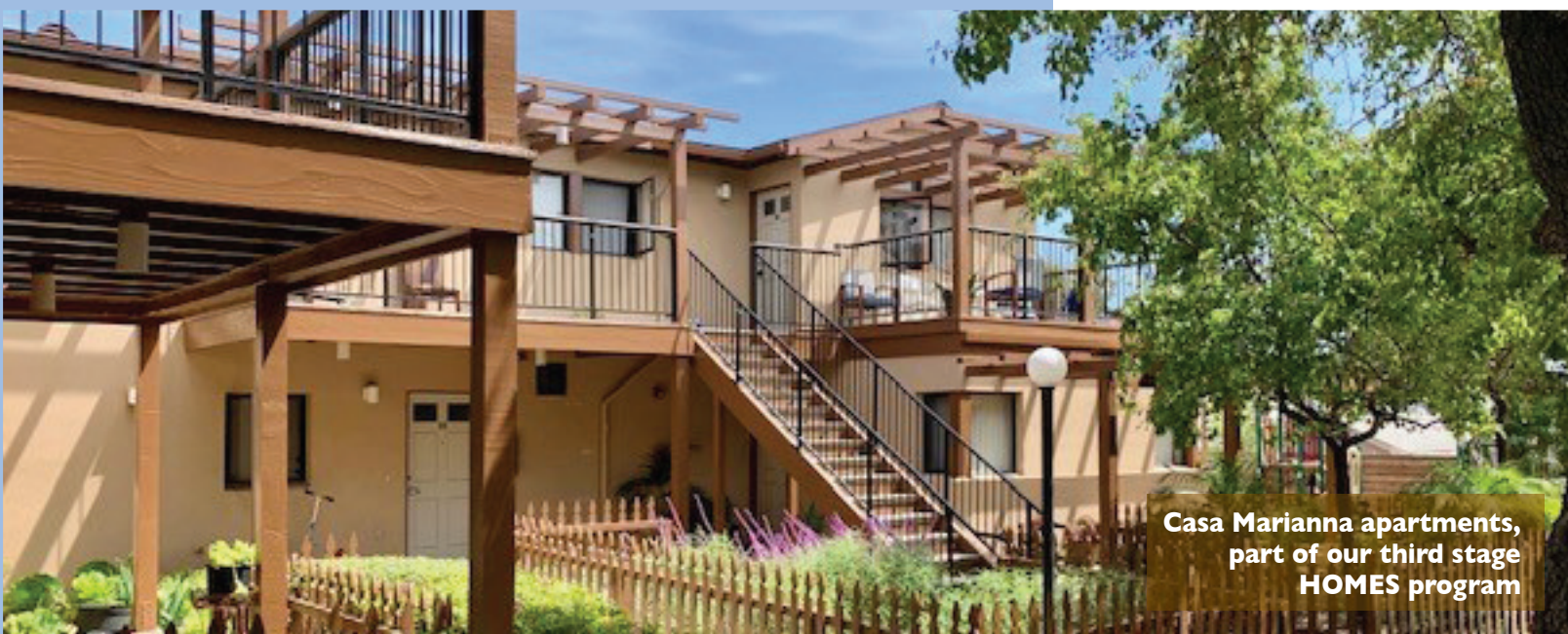
Casa Marianna apartments, part of our third stage HOMES program