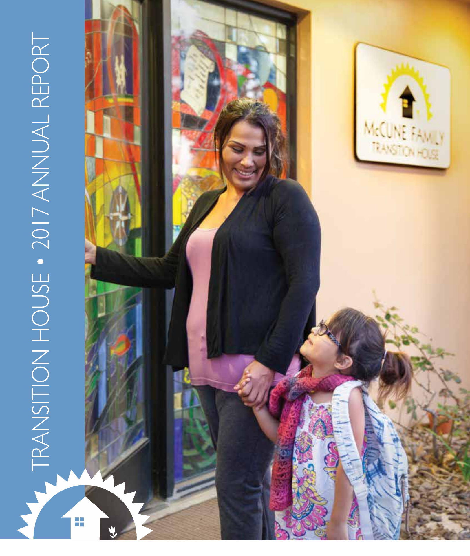
HONORING OUR HELPERS