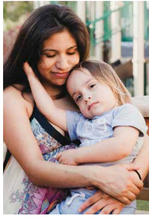
Families receive everything they need to rebuild their lives.

The most important thing we can do for children who are experiencing homelessness is to help their parents secure stable housing. We also foster resilience among these children by providing parenting classes to help parents better navigate the distress of homelessness with their children. We surround kids with caring adults (including many volunteers) who provide mentorship, warmth, and stability while they are with us. Every evening, school-aged kids receive a little TLC—Technology and Literacy for Children—that focuses on building reading and computer skills. Teens have their own group with facilitated discussions, artwork, dance, and academic support. Babies are enrolled in our sliding scale licensed Infant Care Center, which supports them in healthy development while allowing their parents to find full-time work. Volunteers help out in the Center to make it as warm and welcoming for the babies as possible.