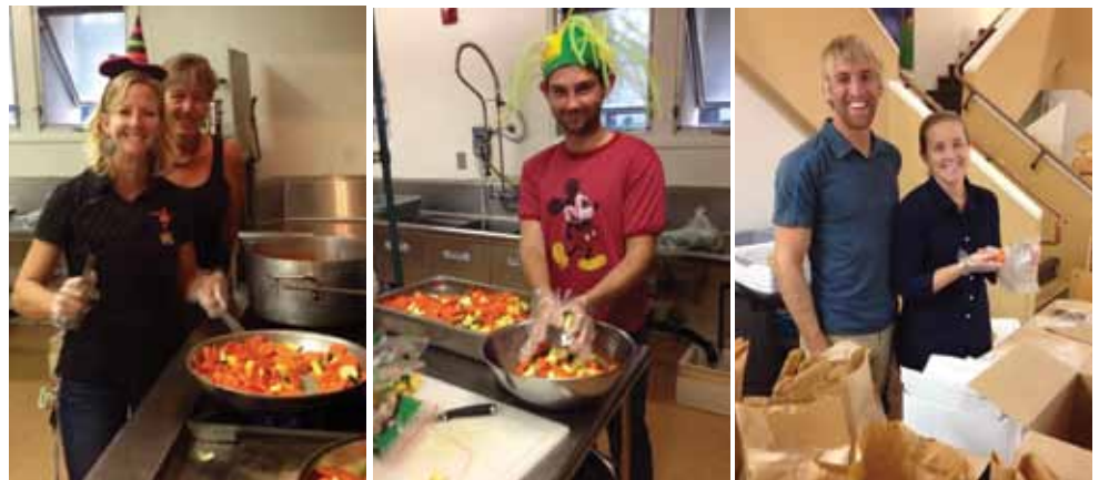
Friends have fun making dinner and sack lunches together—silly hats optional!