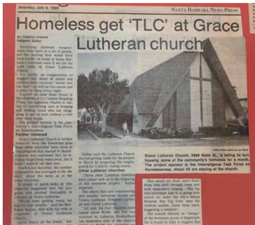
In July of 1985, Grace Lutheran gets positive press coverage for its role in serving the homeless from the Santa Barbara News-Press .